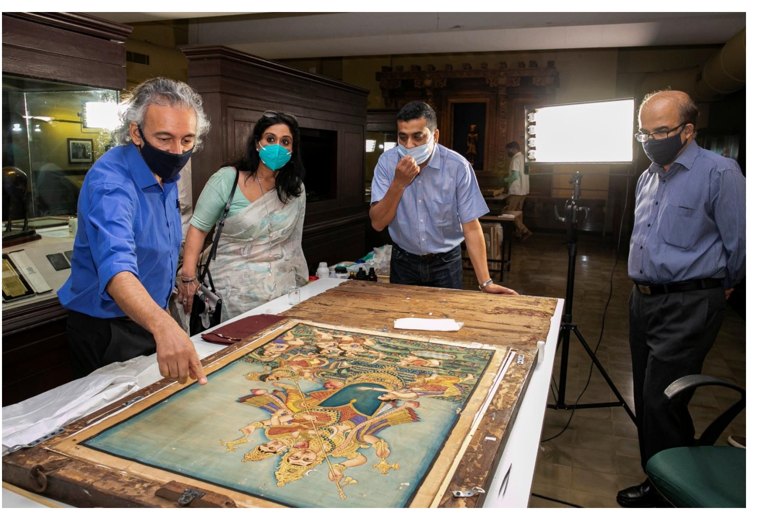
Monitoring of project activities by Citi India officials continued online and with physical visits as soon as restrictions were lifted.